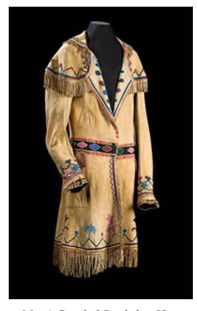
Delaware Man's Beaded Buckskin Hunting Coat about 1850

As the dictionary user can see the earliest time the word for canoe was written down was in 1684 even though the spelling is not very accurate.