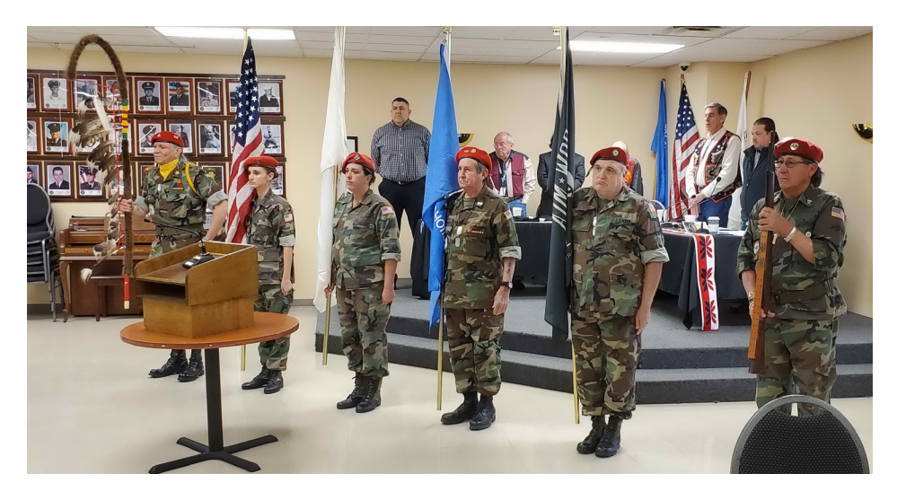
Tribal Color Guard presenting colors at 2019 General Council

Delaware Tribe DV/SA Program 5100 Tuxedo Blvd, Ste C Bartlesville, OK 74006