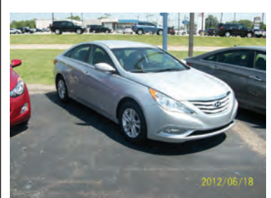
Stock number 13015, $22,113.