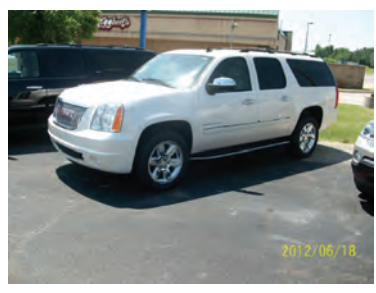
Stock number 12250, $52,702.