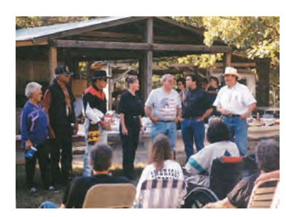
Committee members, 2001