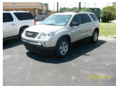
Stock number 12137, $32,372.