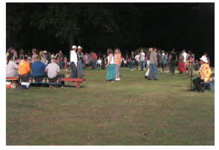
Duck Dance at Delaware Days 2005.