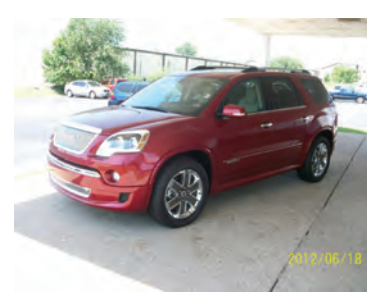
Stock number 12223, $47,531.