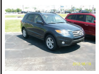
Stock number 12233, $25,715.