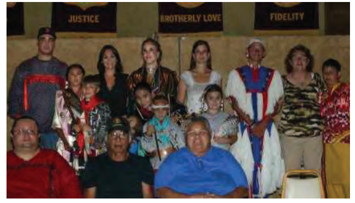
Lenapeowsi Group at Conoco-Philips exhibition. Lenapeowsi literally means "Delaware Way."

A memorial service was held May 23, 2012 at 2pm at Olivet Baptist Church in Veneta, Oregon.■