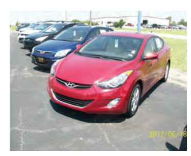
Stock number 13020, $19,520.