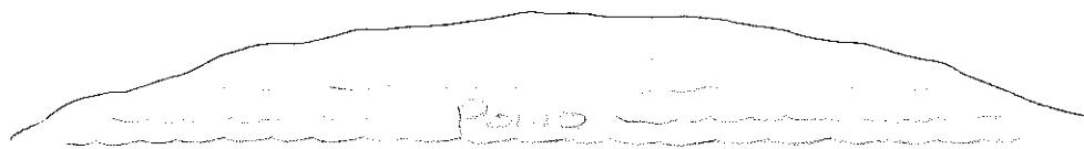
PLAN VIEW 4" = 1'0"