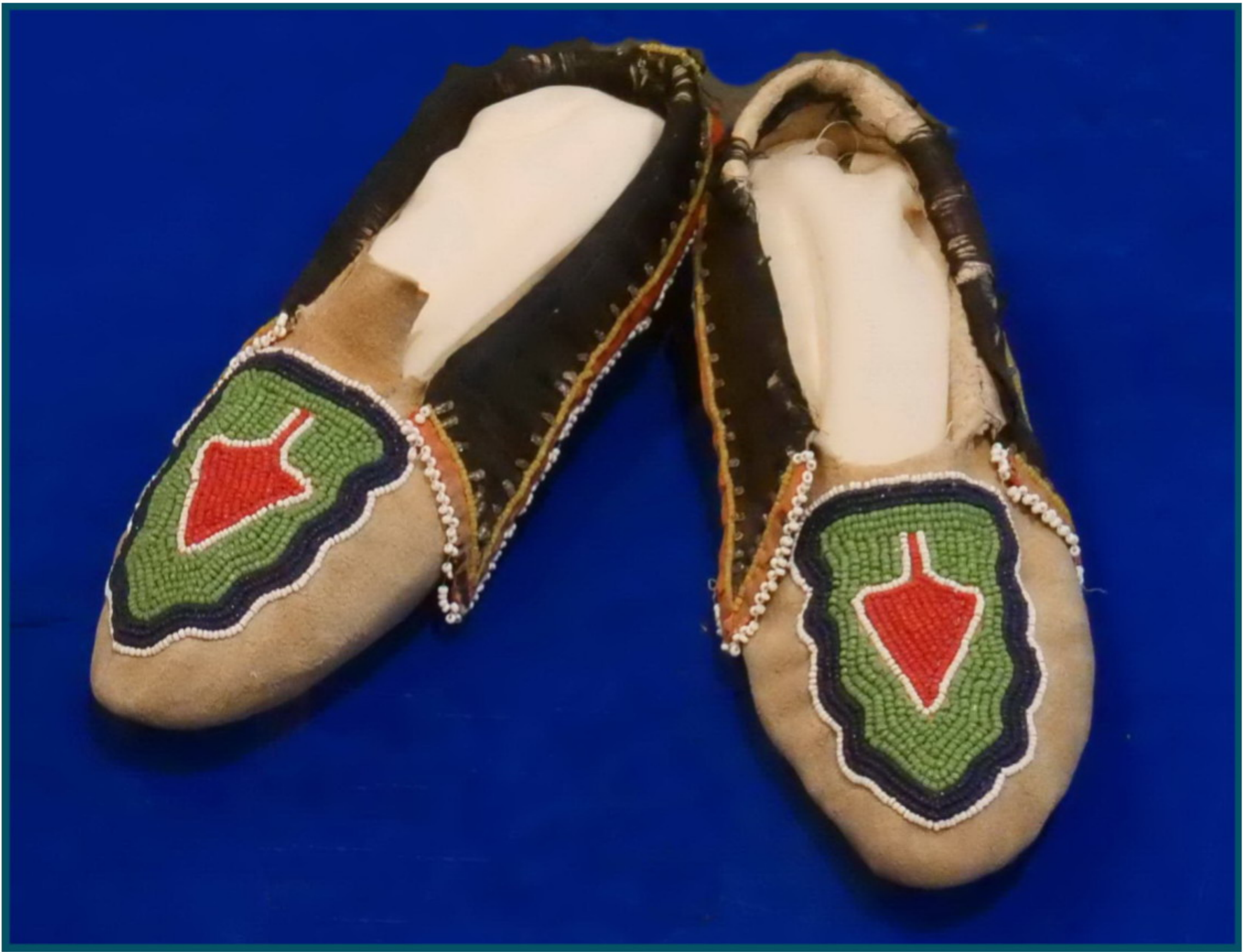
Lënapei Lënhaksëna Delaware Moccasins