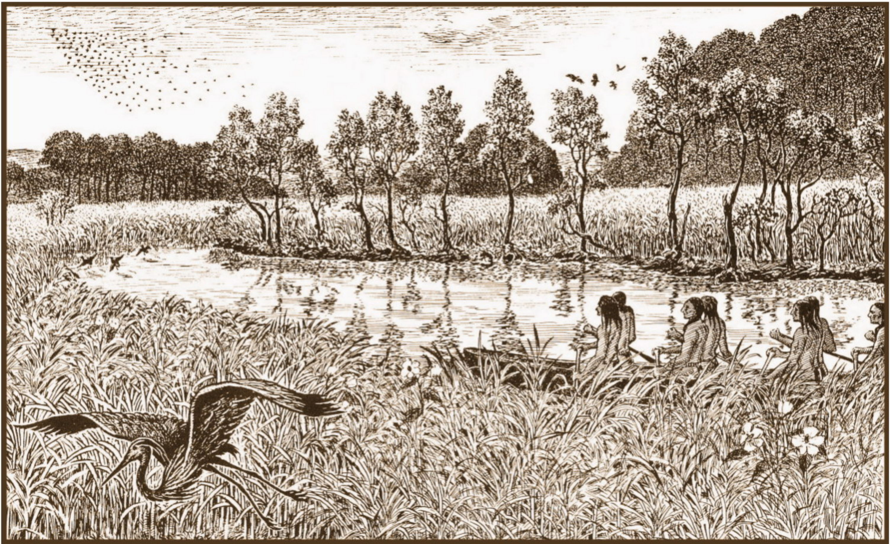
Lenapeyok Chimheyok Delawares are rowing