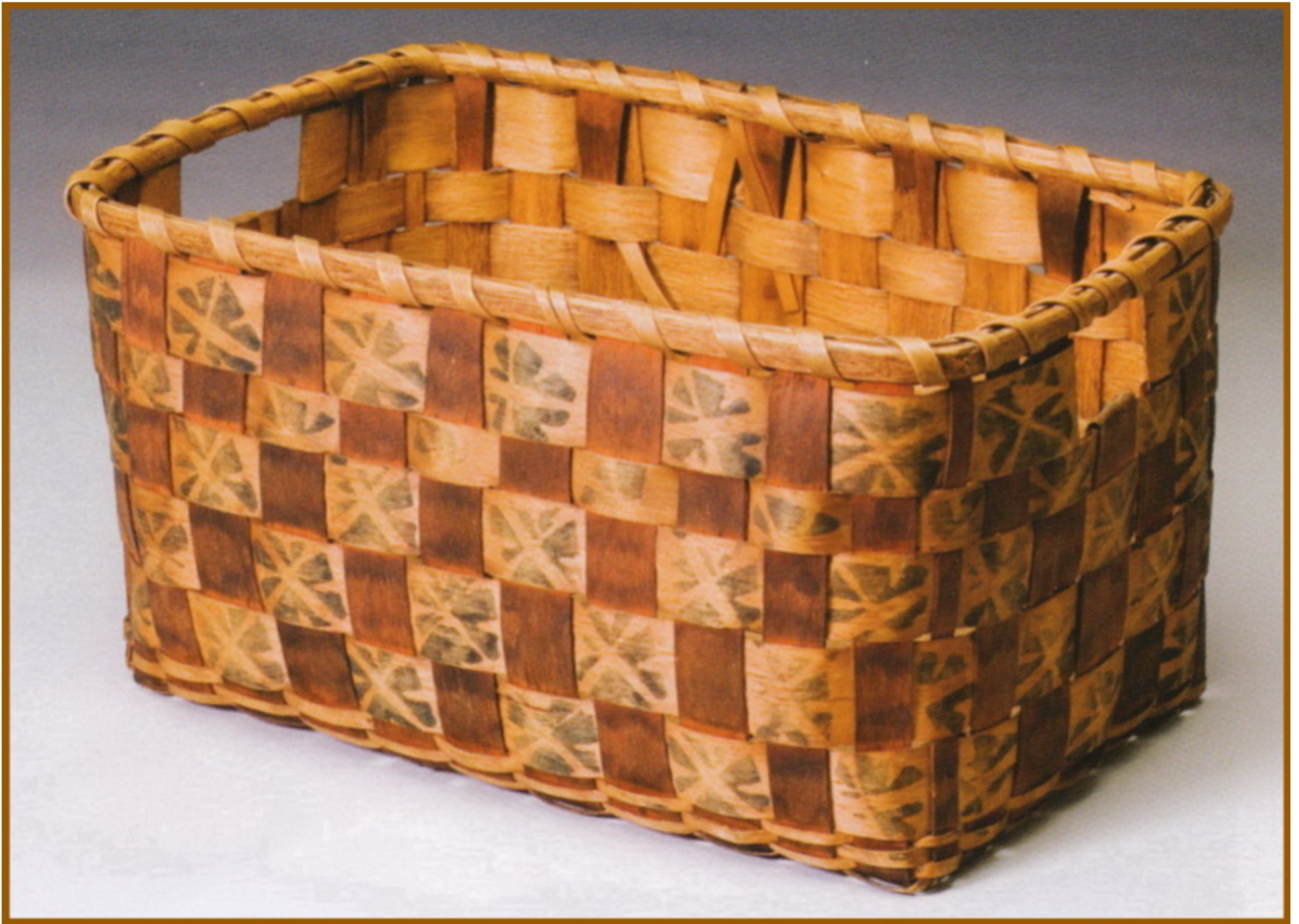
Sàpitahikàn Tànkhakàn Delaware Basket with Block Stamped Designs Collected in Hunterdon County, New Jersey Before 1735