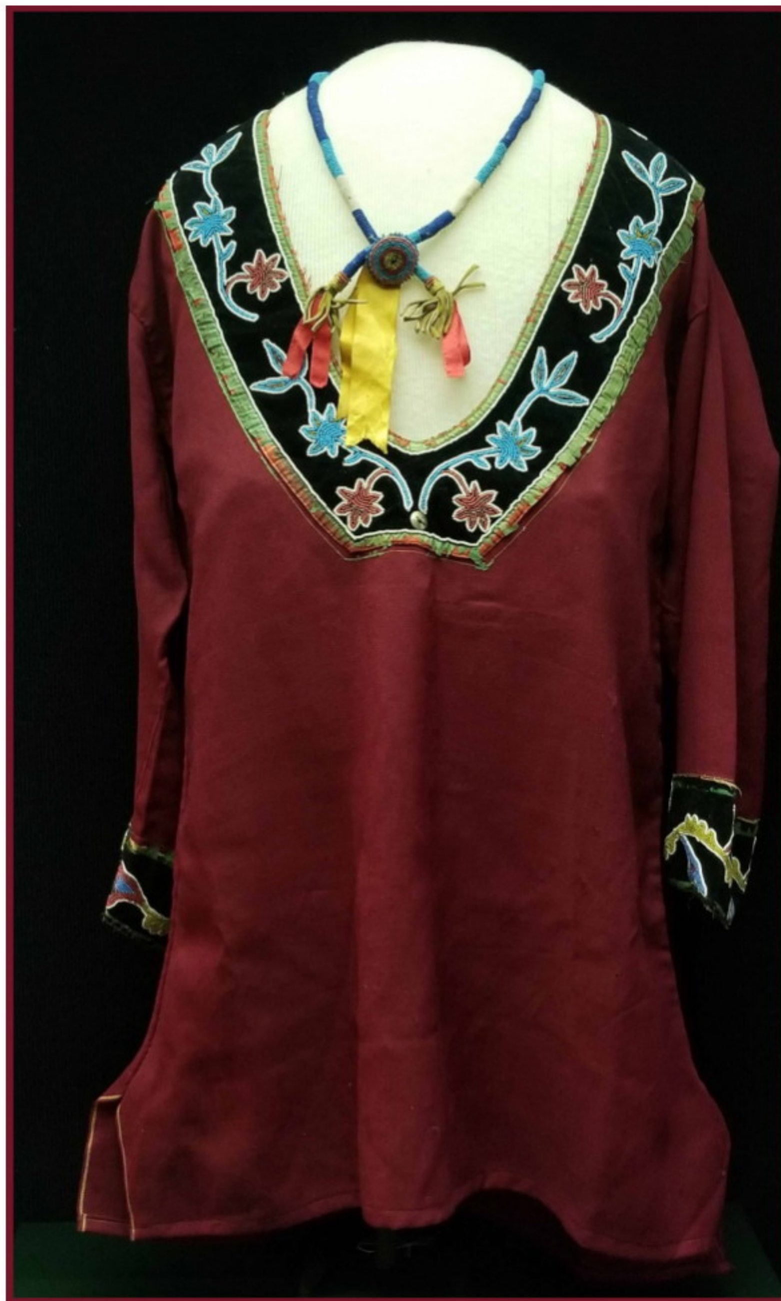
Lënuwahèmpës - Delaware Man's Shirt late 1800's - Frank Speck Collection Delaware Tribal Cultural Center