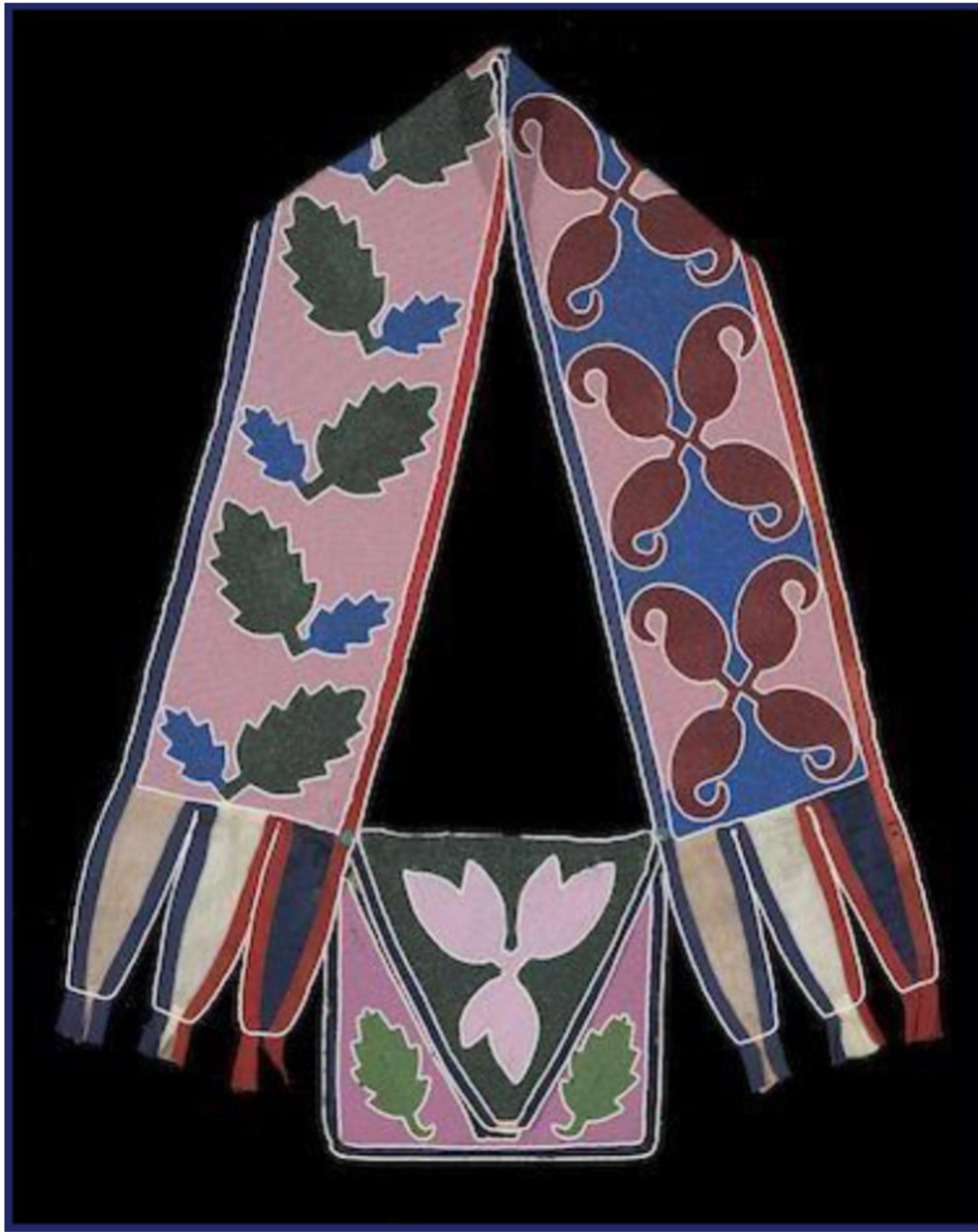
Pëntahsënakan Bandolier Bag