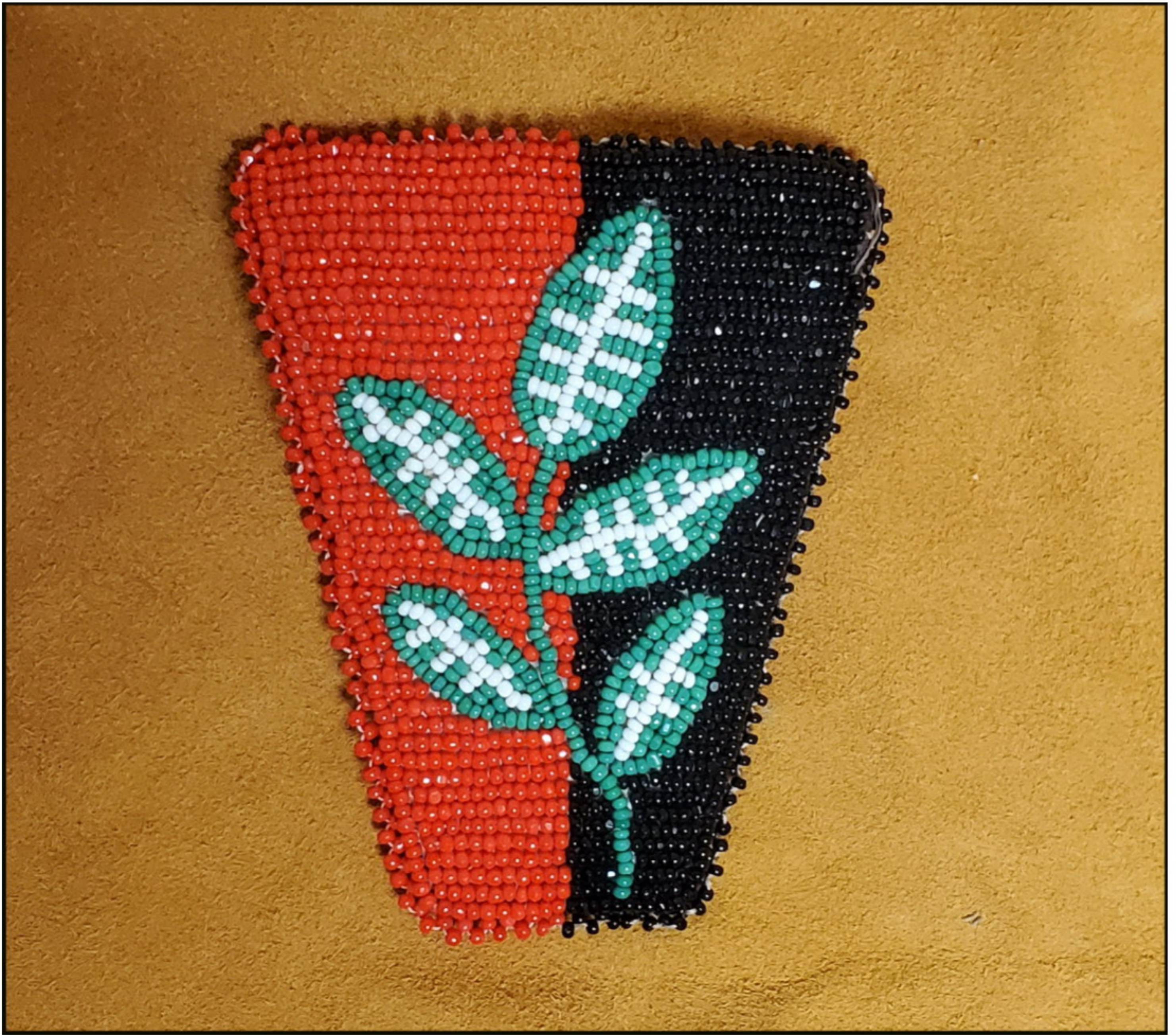
Milaxki Këlakhun Beaded Barrette

This style is worn at the back of the head