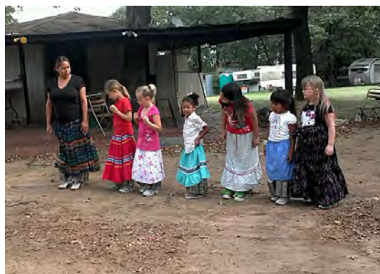
Young and old Delawares enjoy themselves at Delaware Days.