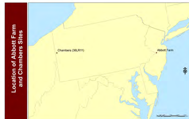
Location of the Chambers site and a few of the objects found there.