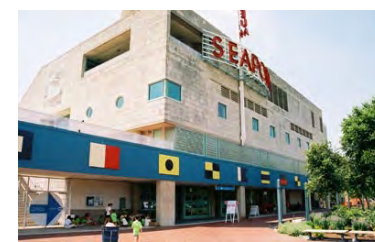
Independence Seaport Museum, from their web site.

All expenses for this invited trip were paid for by the Seaport Museum and PennDOT, the Pennsylvania Department of Transportation.■