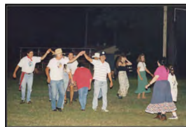
Duck Dance 1998