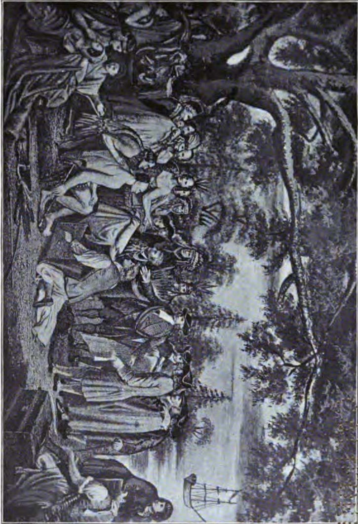
WILLIAM PENN TREATING WITH DELAWARE INDIANS, 1682.