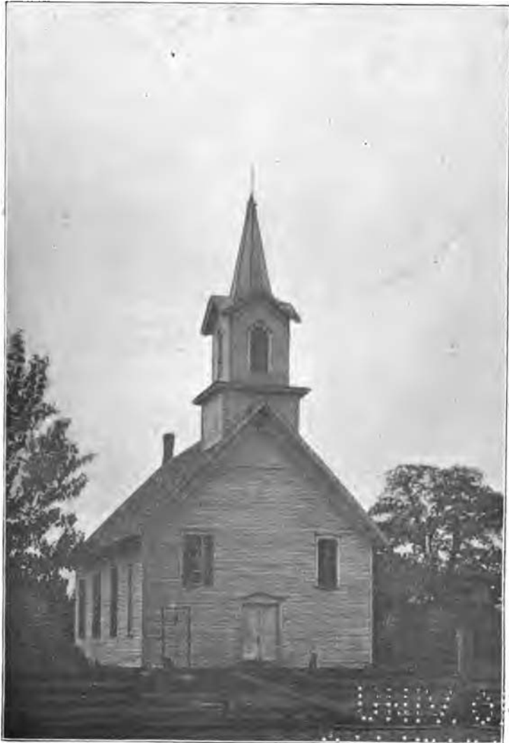
DELAWARE BAPTIST CHURCH.