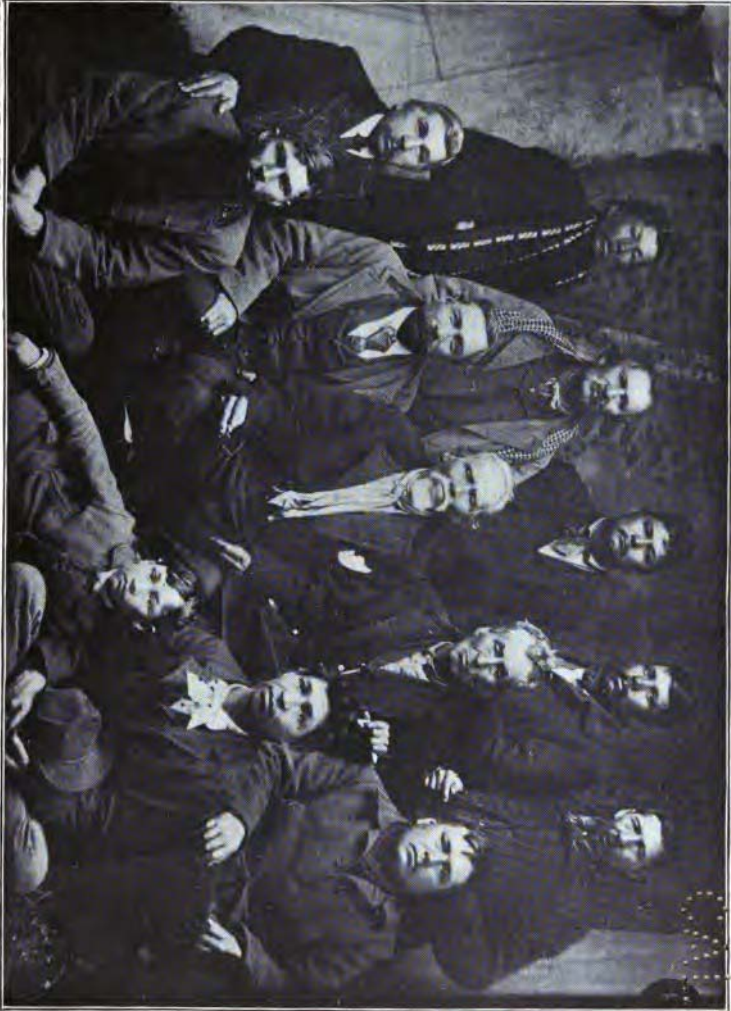
A GROUP OF DELAWARE INDIANS.