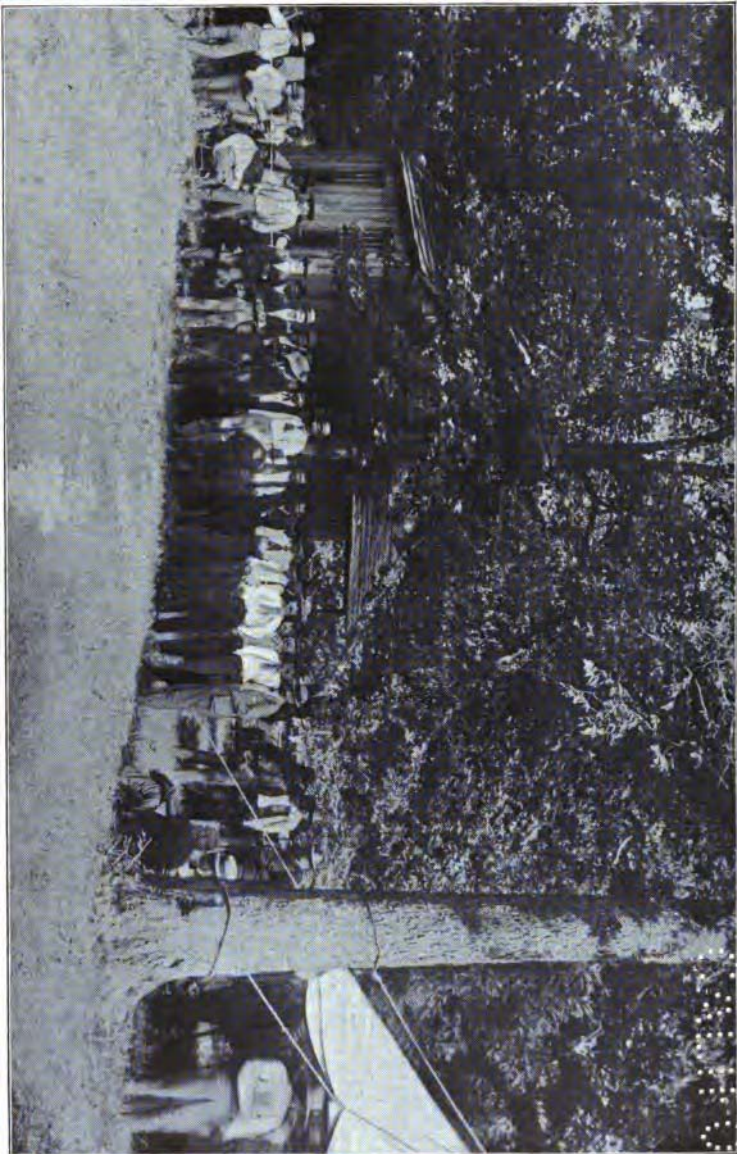
DELAWARE INDIAN PAY HOUSE, 1893.