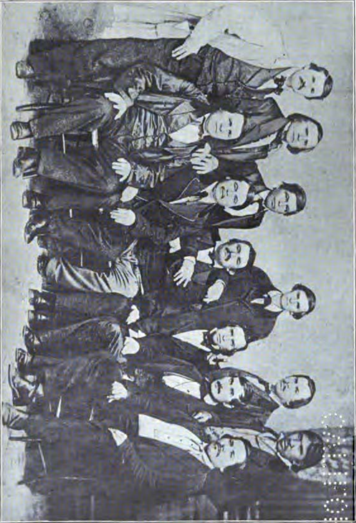
DELAWARE INDIAN DELEGATES TO WASHINGTON, 1866, AND PARTIES TO DELAWARE-CHEROKEE AGREEMENT, 1867.