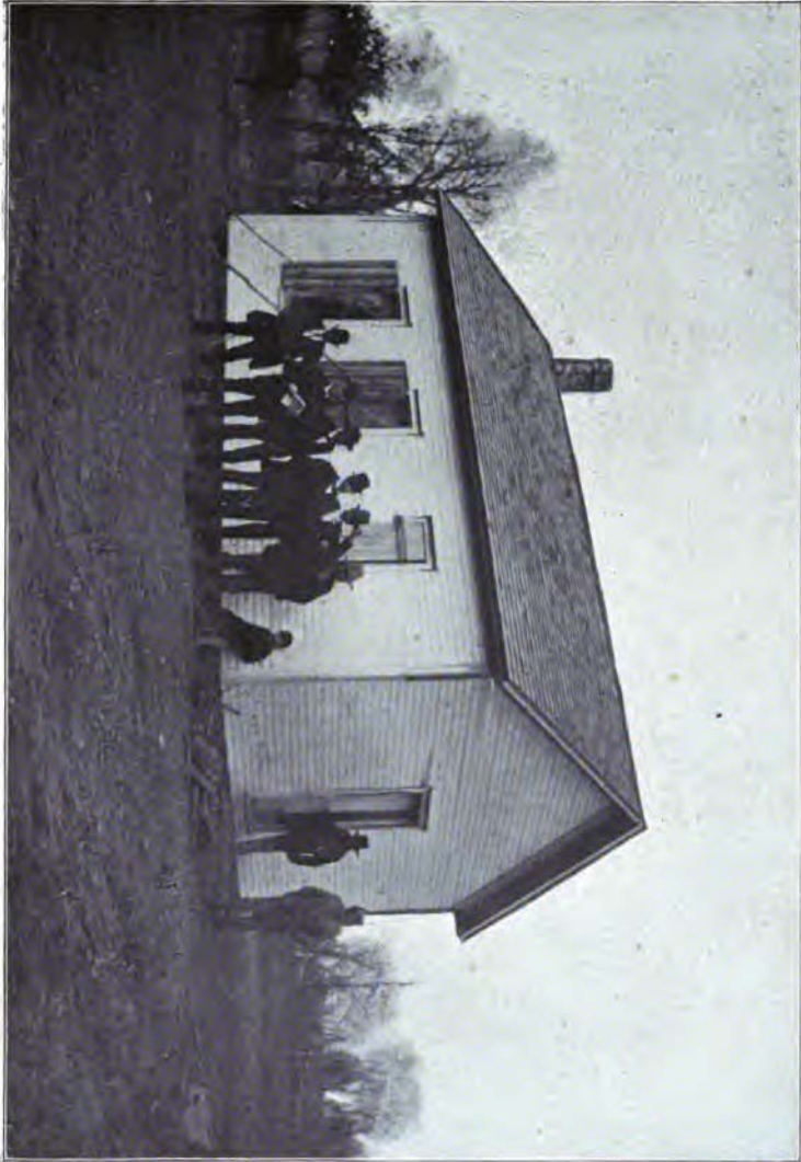
CALIFORNIA CREEK SCHOOL HOUSE.